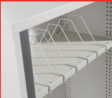
Wrap around wire rack.