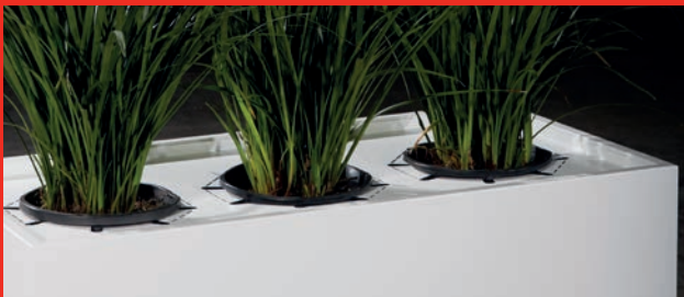
Plain planter, designed to achieve maximum strength and rigidity.