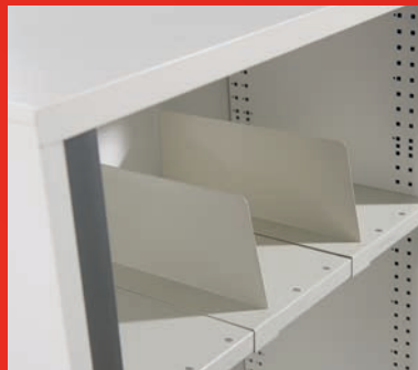
Shelf dividers clip-on.