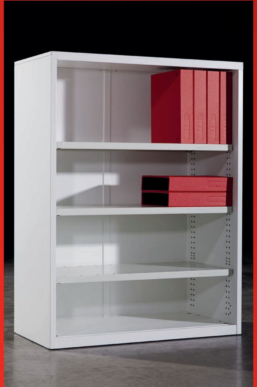
Without doors, bookcase.