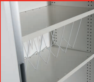
Suspended wire rack.