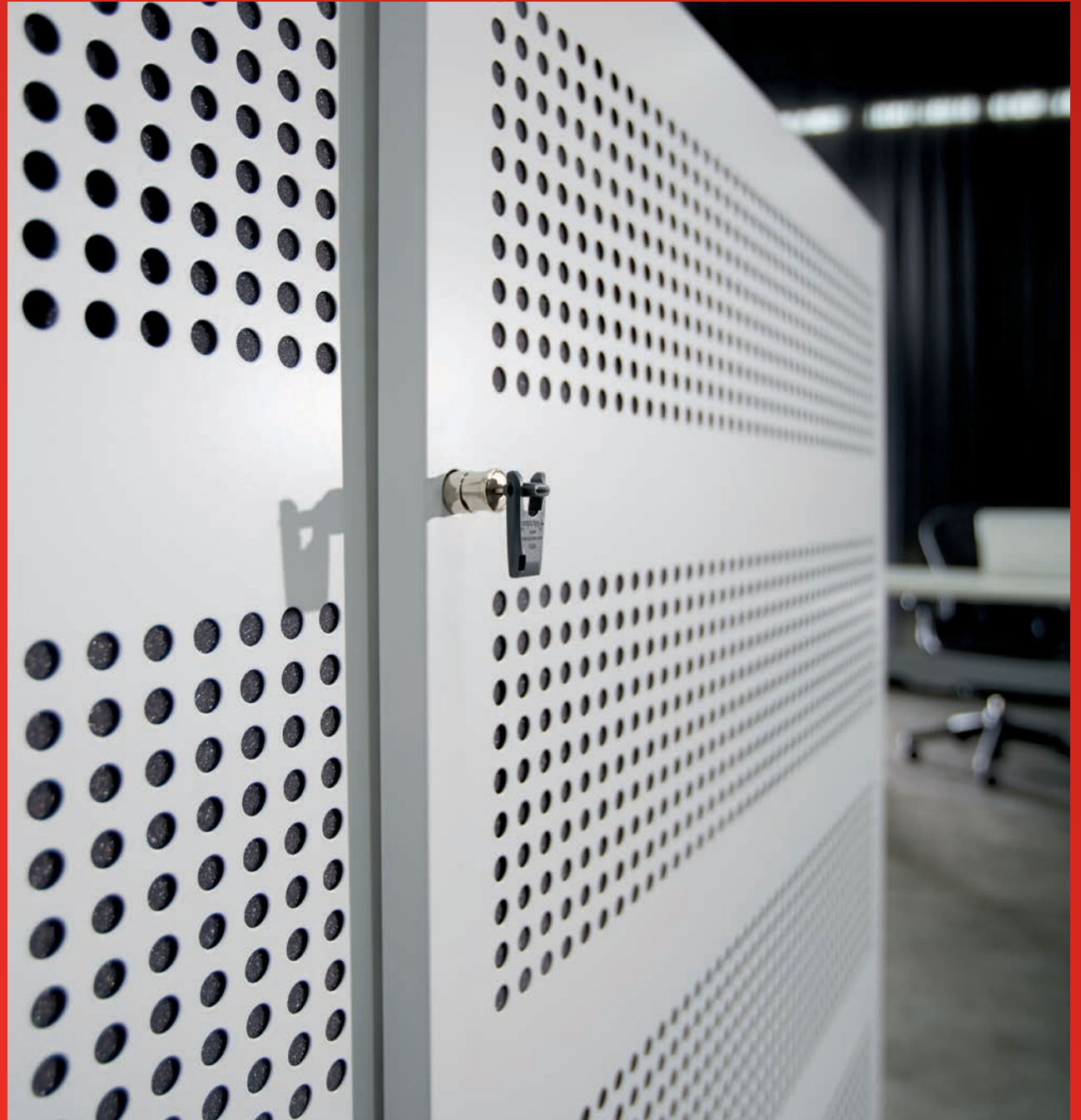
Perforated doors with acoustic sound absorption panels create a modern aesthetic and enhanced sound absorption.