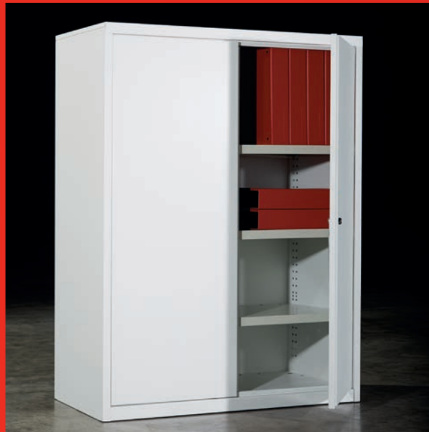
With doors, swing door cabinet.