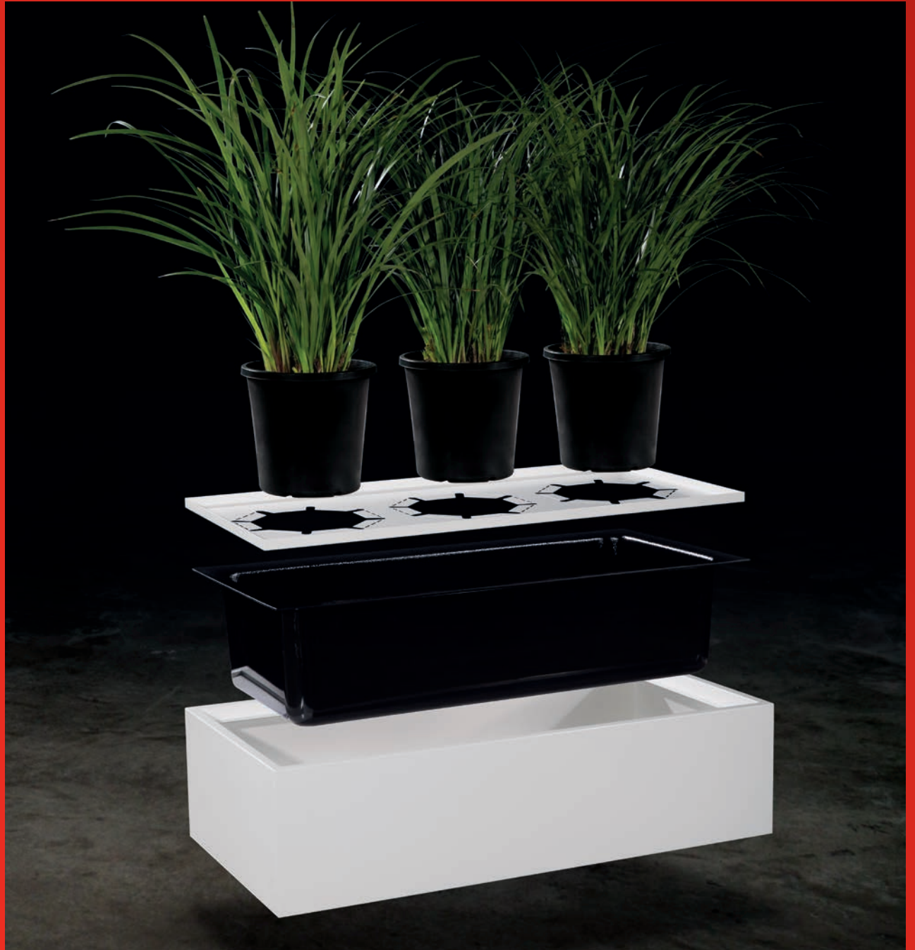
The Strata 2 planters have been designed to work together with the entire suite of Strata 2 cabinets. The modular design accommodates all plant types, and ensures easy maintenance and care.