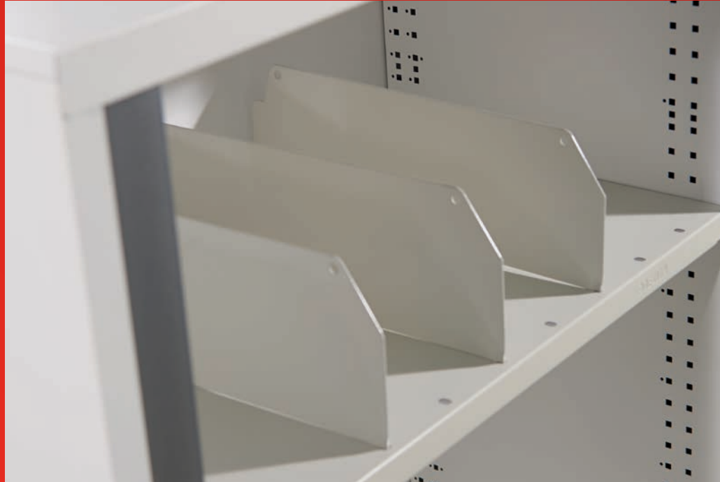
Slotted shelf dividers.