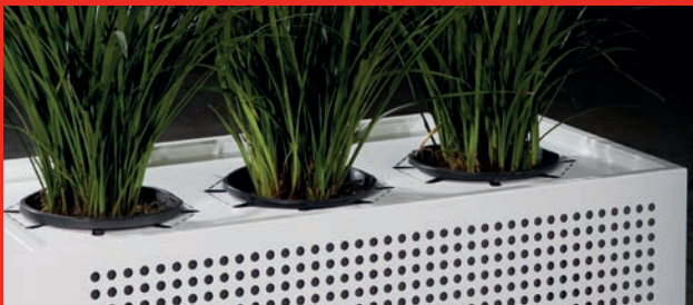
Perforated planter, provides acoustic dampening.