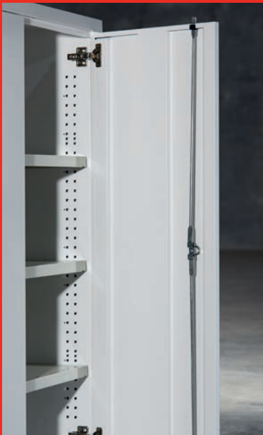
Lockable doors provide extra security for sensitive documents.