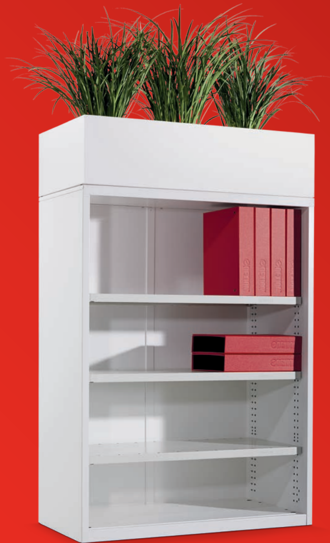
No door (Bookcase)